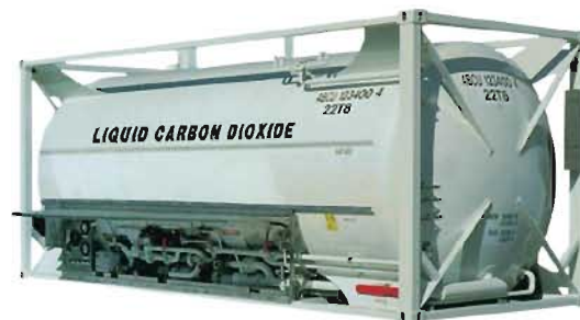
COVAC Intermodal Container