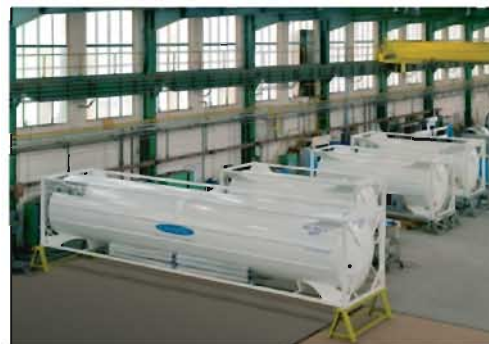
40 ft. Intermodal Container