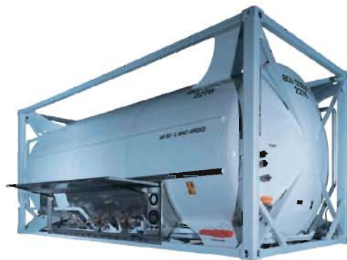
TVAC & PVAC Intermodal Container